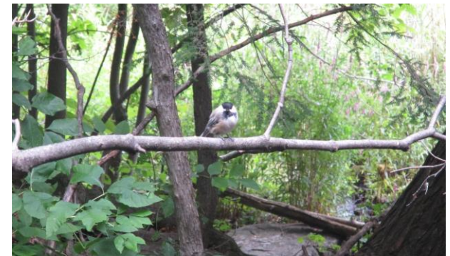
(CHICKADEE ON DULINE TRAIL)

Guided walks through the woods offer the opportunity to potentially see wildlife native to Eastern Ontario, including white-tailed deer, garter snakes, frogs, and snapping turtles. The high canopy of Sugar Maples provides shade from the summer heat as well as spectacular views of the understory.