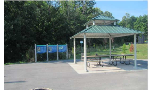
(GAZEBO BY THE SOCCER FIELD)

If you see us in our bright shirts please stop and say hello! Or if you have questions please stop us and ask. We love to answer questions.