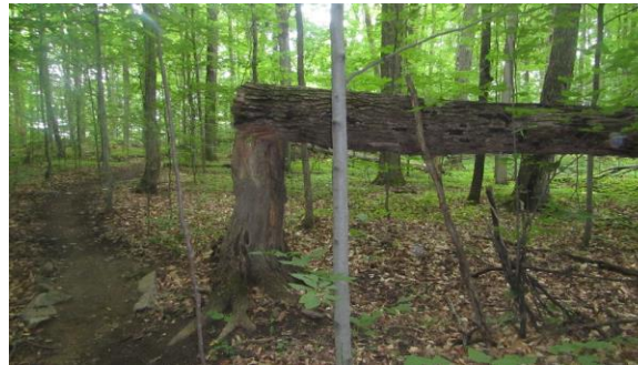
(FALLEN TREE ON TRILLIUM TRAIL)

We lead summer camp groups – as well as members of the public of all ages – on guided walks through Trillium Woods